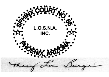
High Priestess rde X